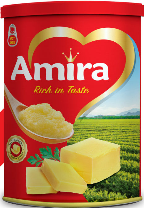
Amira Yellow Ghee 4 x 2.5 kg Gross Weight: 11.449 kg Net Weight: 10 kg