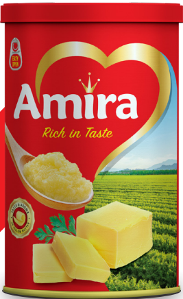
Amira Yellow ghee 6x0.750 kg Gross Weight: 5.392 kg Net Weight: 4.500 kg