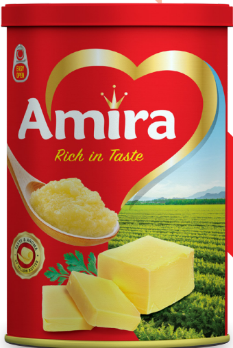
Amira Yellow ghee 4x1.5kg Gross Weight: 6.956 kg Net Weight: 6 kg