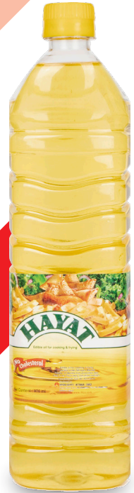
Hayat oil 12x970 ml PET Gross Weight: 11.174 kg Net Weight: 10.569 kg