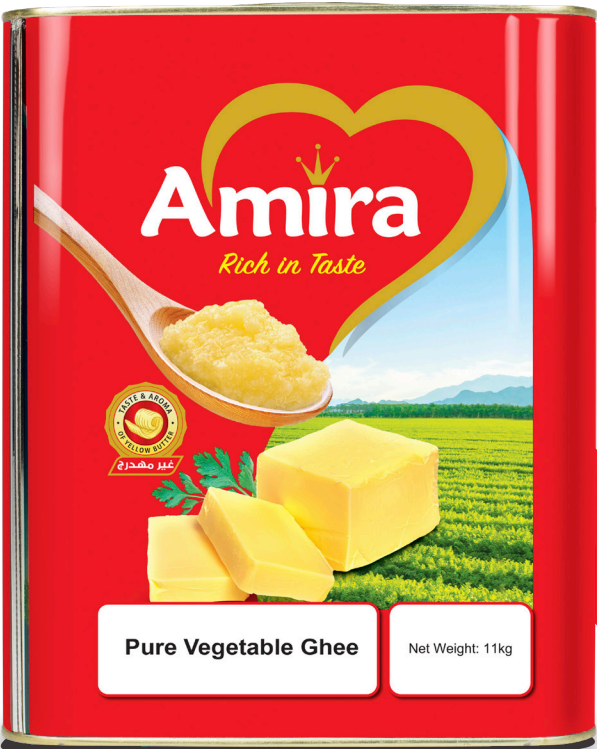
Amira Yellow ghee 11 kg net Gross Weight: 11.795 kg Net Weight: 11 kg