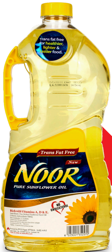
Noor S.F 4 x 2.7 L PET Gross Weight: 10.644 kg Net Weight: 9.871 kg