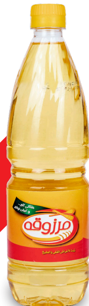
Marzouka oil 12 x700 ml PET Gross Weight: 8.193 kg Net Weight: 7.627 kg