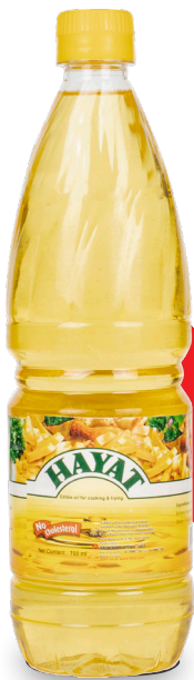
Hayat oil 12 x700 ml PET Gross Weight: 8.193 kg Net Weight: 7.627 kg

Hayat's portfolio has a wide range of products, from Cooking Oils and Ghee to Condiments.