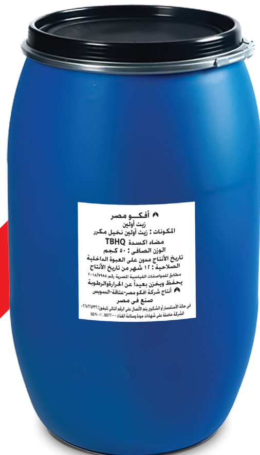
Hayat Olein 50 lt Drums Gross Weight: 53.500 kg Net Weight: 50 kg