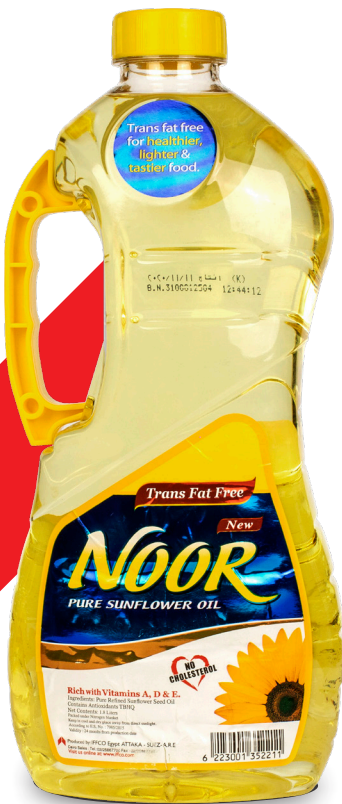
Noor S.F 4 x 1.8 lt Gross Weight: 7.180 kg Net Weight: 6.580 kg