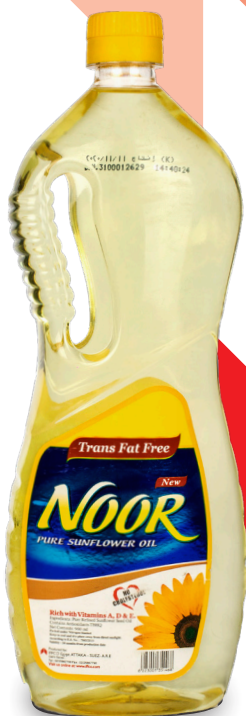
Noor S.F 6 x 900 ml PET Gross Weight: 5.352 kg Net Weight: 4.935 kg

Noor originated in 1985 with the launch of Noor Sunflower oil and was the first brand in Middle East to introduce trans-fat cooking oils. Since then we are passionate about helping families enjoy healthy and tasty meals.