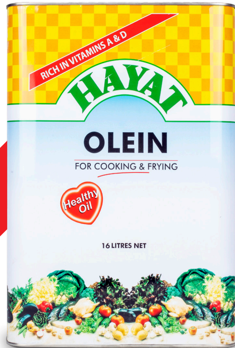
Hayat Olein Tin 16 lt Gross Weight: 15.325 kg Net Weight: 14.400 kg